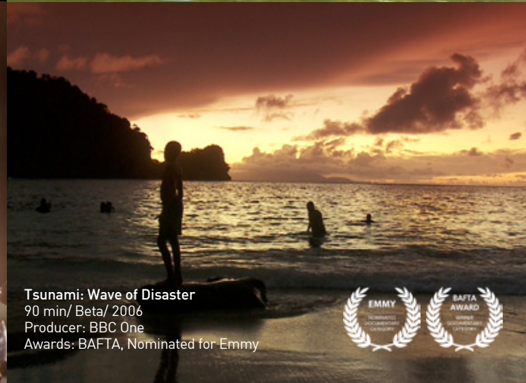
Tsunami: Wave of Disaster 90 min/ Beta/ 2006 Producer: BBC One Awards: BAFTA, Nominated for Emmy