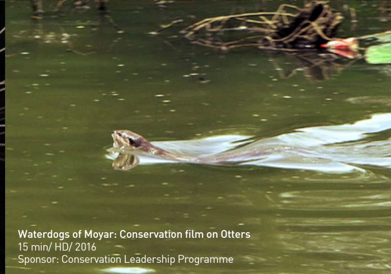
Waterdogs of Moyar: Conservation film on Otters 15 min/ HD/ 2016 Sponsor: Conservation Leadership Programme