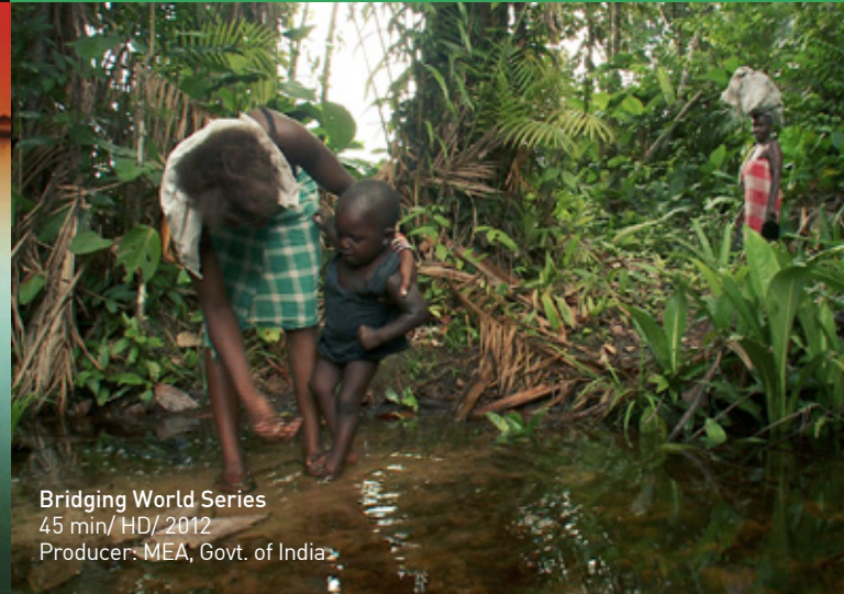
Bridging World Series 45 min/ HD/ 2012 Producer: MEA, Govt. of India