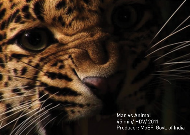
Man vs Animal 45 min/ HDV/ 2011 Producer: MoEF, Govt. of India