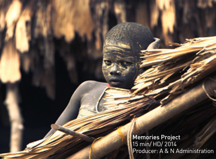
Memories Project 15 min/ HD/ 2014 Producer: A & N Administration

A brief snapshot of some of the films we have worked on ranging from documentaries for leading channels like BBC, Doordarshan, National Geographic ( Tsunami: Wave of Disaster , Ganga: Ribbon of Life ); to films for conservation spanning multiple mediums for targeted audiences ( Waterdogs of Moyar ) to community led films dealing with sensitive social and cultural issues ( A museum of their own ) and commercial work like corporate videos and TVCs ( Tata Capital Promos ).