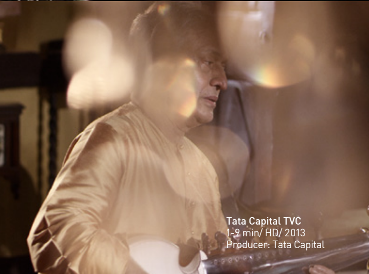
Tata Capital TVC 1-2 min/ HD/ 2013 Producer: Tata Capital