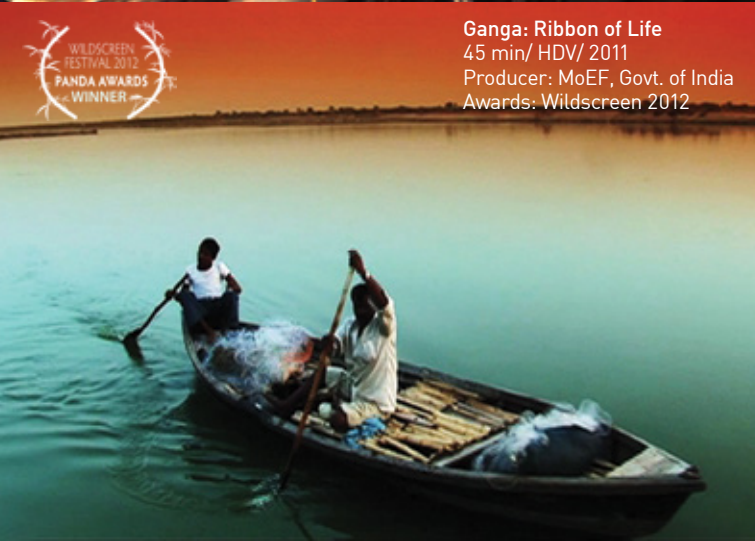
Ganga: Ribbon of Life 45 min/ HDV/ 2011 Producer: MoEF, Govt. of India Awards: Wildscreen 2012